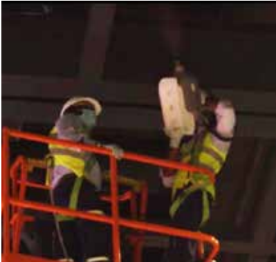
Air change rate in the halls is 8 times per hour. Air extraction in the halls is pre-scheduled and all hall shutter doors will be kept open both before and after the event to assist with air circulation