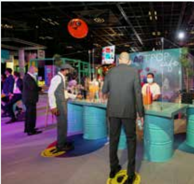
Buffet permitted if served by waiting staff. Individually packaged food and beverage items available.