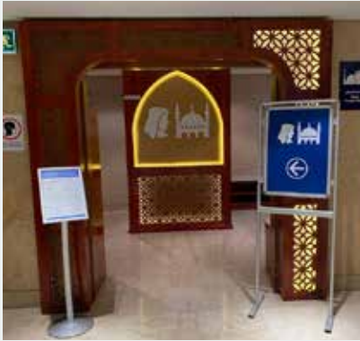
Prayer rooms are open and follow federal guidelines