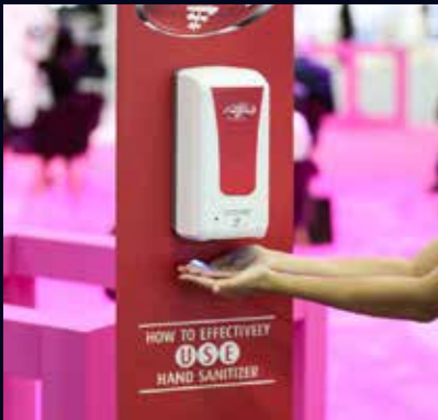
Sanitisers readily available at multiple locations