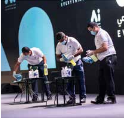
Disinfection protocols are adhered to in all public areas, F&B outlets & restrooms