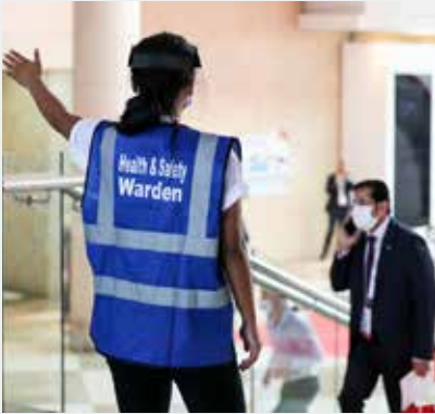
Health & Safety Wardens will strictly enforce all policies. A penalty of AED 3,000 may be levied by government authorities for non-compliance