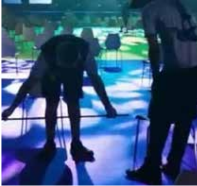
Conference chairs are set 2 metres apart from each other at the conference