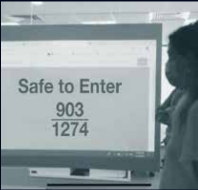
Real time monitoring of crowd density and venue capacity