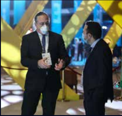
Avoid shaking hands and exchanging business cards