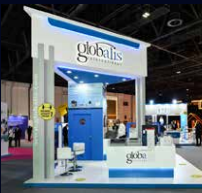
Exhibition stand maximum capacity and the minimum 2m social distancing guideline to be respected at all times