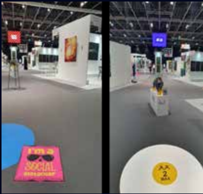
Aisles shall be a minimum of 2.5 metres width one way and 4 metres for 2-way traffic