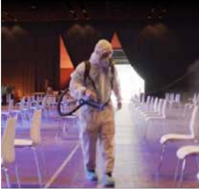
Conference chairs are protected with an antimicrobial shield and are sanitised regularly