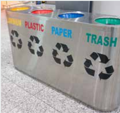
Individual bins for the disposal of PPE , will be provided by the exhibitor on their stands