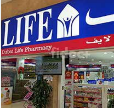
Life Pharmacy open throughout the show period. Location concourse 2 (between hall 6 & 7)