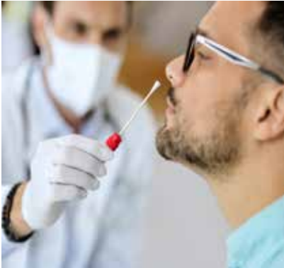
PCR Testing Clinic available onsite