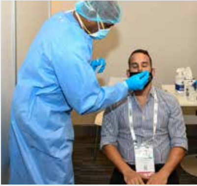
Exhibitors appointed stand building contracting company and any temporary staff working onsite during the build up need to provide a negative Covid 19 Test Result to gain access to the Exhibition Halls.