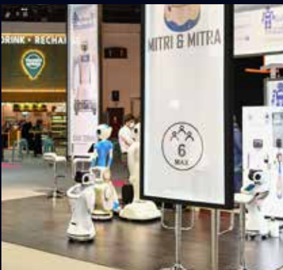
Clear signage of maximum capacity allowed at any one time will be displayed on the front of the stand. If a stand has a meeting room - maximum capacity will be displayed also