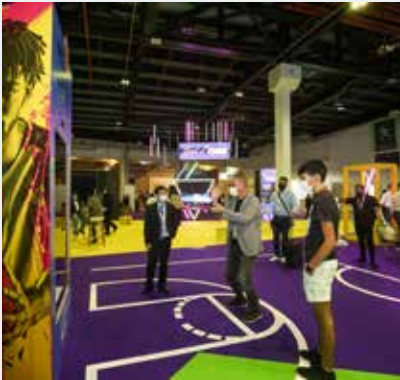
All product demos and activations within a stand must observe a 2 metre social distance. The viewing area will be on the stand and will also incorporate social distancing of 2 metres