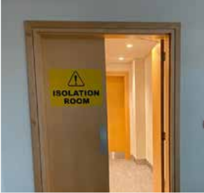
Isolation rooms are set up at the venue for suspected cases.