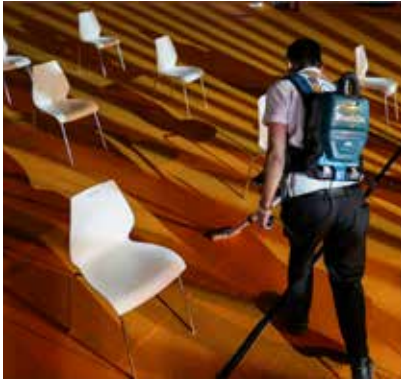
Exhibition halls shall close at 10pm for daily sterilisation and sanitisation