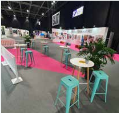
Food and beverages to be consumed in dedicated F&B areas where masks may be removed when seated.